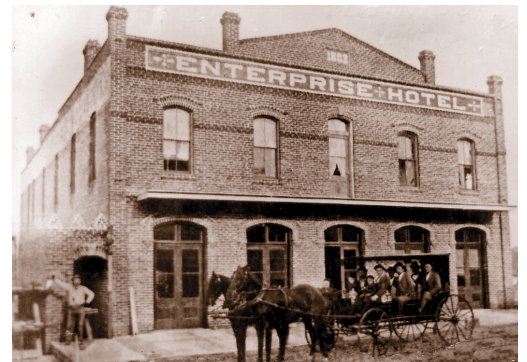
Folsom History Museum

Built on Sutter Street in 1893, the Enterprise Hotel held weddings in its lobby. The Granite House will recreate the style – and the lobby – of a grand hotel in historic Folsom, though not the function.