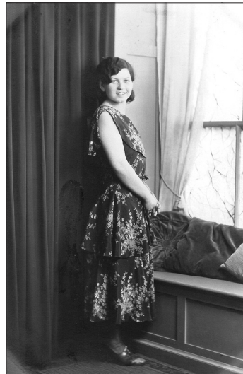
Georgia at 17 (top) and 19